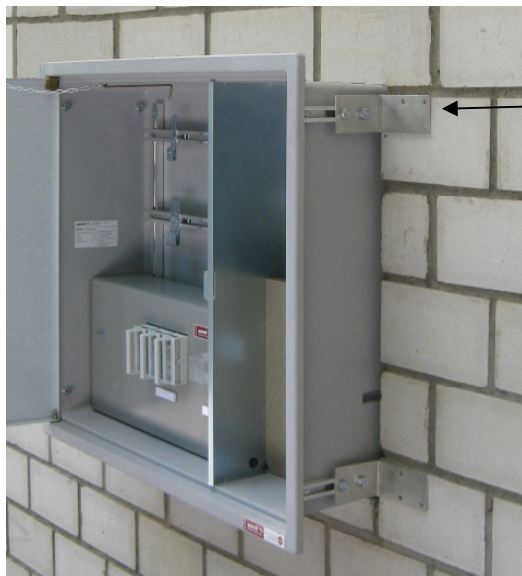
4 Mounting angles

Simple and quick assembly. 4 screws are sufficient (dowel 8 mm, screw 6 mm). After assembly, the box can also be adjusted to the required insulation thickness.